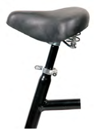
Illustration 3: Adjustable seat.