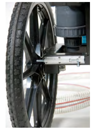
Illustration1 : Brakes to prevent the wheels from rolling