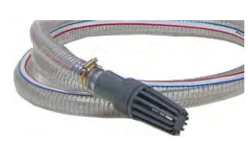
Illustration 2 : Intake hose. Submerge the intake hose head into water source.